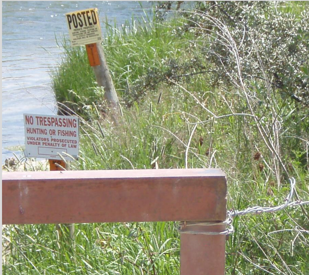
Ruby River Crossing Summer 2008