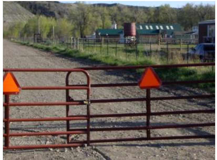
Locked Gate on Yellowstone County Road