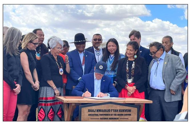
President signing National Monument Proclamation August 8, 2023

up of three distinct areas to the south, northeast, and northwest of Grand Canyon National Park. It is bordered by the Kanab Creek watershed to the northwest, the Havasupai and Navajo reservations to the south, and stretches from Marble Canyon to the Kaibab Plateau in the northeast.