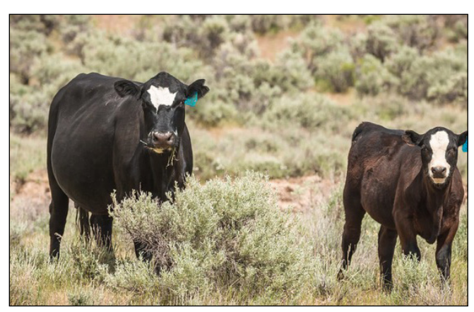
Grazing on the Public Lands - Oregon

of Intent to prepare an EIS to support proposed revisions to the grazing regulations. The PLF on June 18, 2020 also co-signed a collaborative letter with other organizations to BLM providing comments on proposed revisions to the grazing regulations. The PLF updated a Livestock Grazing Position Statement in May 2023 and posted the Position Statement on the PLF website. The PLF will continue to track the development of updated grazing program policies and guidance and provide comments as appropriate.