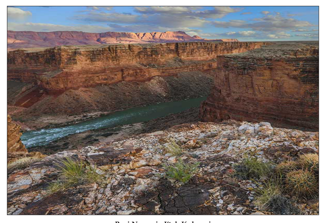
Baaj Nwaavjo I'tah Kukveni Ancestral Footprints of the Grand Canyon National Monument, Arizona