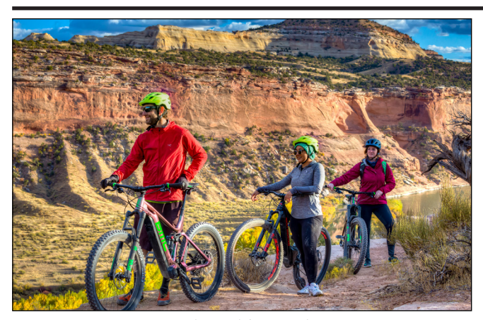
Recreation on the Public Lands

In sharing the Blueprint, BLM invited partners to share their feedback to further enhance the vision and its implementation. The BLM and the Foundation for America's Public Lands anticipate hosting a series of public roundtable discussions to allow partners to share their perspectives and further explore partnership needs and opportunities. The first virtual roundtable discussion was held on October 5, 2023. The BLM will also be developing national and state action plans to ensure progress towards meeting the vision outlined in the Blueprint.