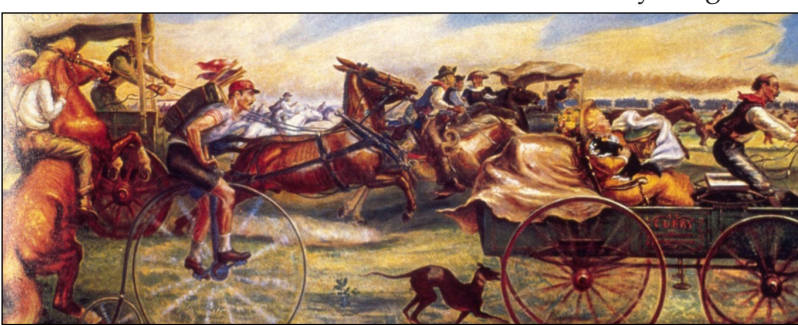
Oklahoma Land Rush by John Steuart Curry

When the dust settled, thousands of land patents were recorded during what is often thought of as the last days of the wide-open West. Many historians mark this event as "The Closing of the American Frontier" and the end of a two century-long era of