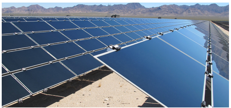
Silver State Solar project - Nevada

The PLF provided comments to the BLM on a Proposed Rule for solar and wind energy right-of-way authorizations on the public lands under the 43 CFR 2800 regulations. Those comments are posted on the PLF website and the PLF will continue to track development of those regulations.