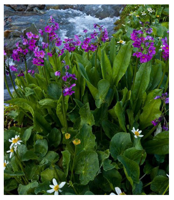
American Basin ACEC - Colorado

The PLF updated a Position Statement on Livestock Grazing on the public lands and posted the Position Statement on the PLF website. The BLM in August 2023 suspended work on the grazing regulations. However, the PLF will continue to track the development of updated BLM grazing program policies and guidance.