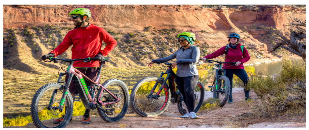
Recreation on the Public Lands

The PLF updated a Position Statement on Recreation Use on Public Lands which includes several recommendations to enhance the recreation program on the public lands. The PLF also submitted comments to the BLM on the "Blueprint for 21st Century Outdoor Recreation" which was released in 2023. The PLF has been added to the list of interested parties for future outreach efforts on this initiative.