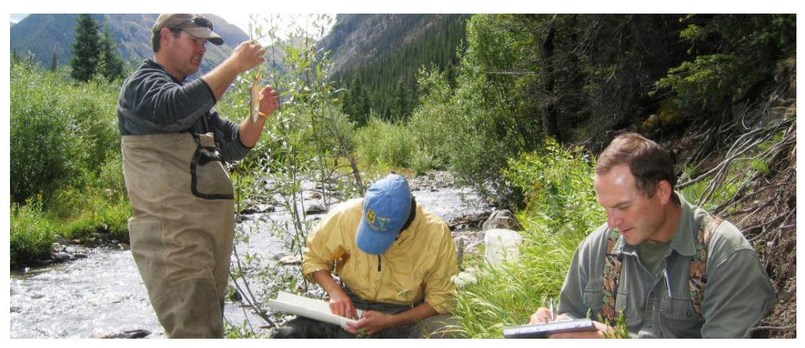
Cunningham Creek Fish Survey, Colorado