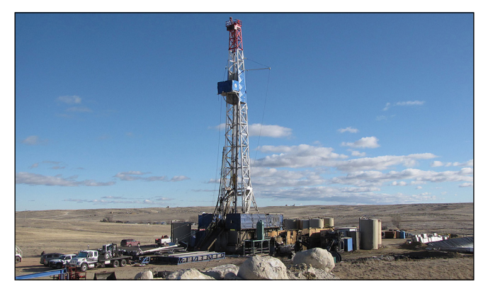
Oil and Gas Drill Rig

PLF POSITION: The PLF submitted comments on the Proposed Leasing Rule to BLM on September 8, 2023. Those comments are posted on the PLF website.