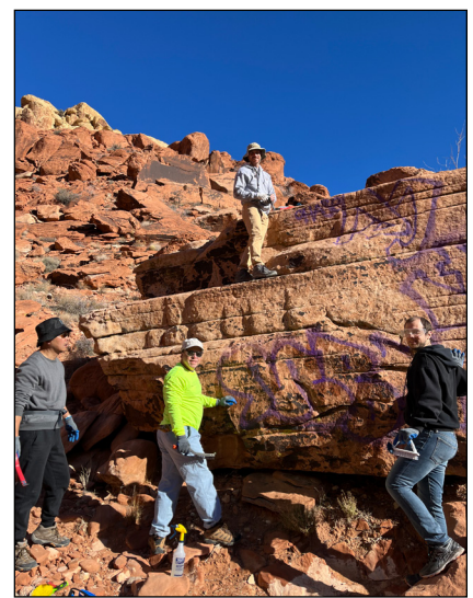
ongoing BLM Friends of Red Rock Canyon–Ash Springs programs such graffiti removal.

the decades to play a vital role in supporting a wide range of conservation initiatives and community outreach efforts. To date, FRIENDS has contributed over $2.8 million in direct financial aid to support Red Rock Canyon. These funds have gone towards programs such as trail mainte-