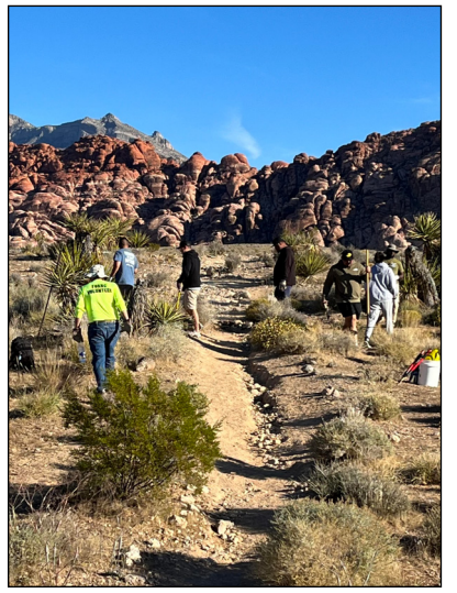
Friends of Red Rock Canyon–Trails maintenance.

nance, tortoise habitat support, cultural resource preservation, wilderness waste clean-up, invasive plant removal, and graffiti removal. The funds have also contributed to special projects over the years such as the Cottonwood Recreational Area Management Plan and the restoration of the Calico Hills and Moenkopi Trails.