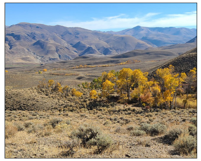
Upper Salmon River Restoration Project, ID.

About half of the recently released funds, or some $20.5 million, are allocated for 26 projects under the Good Neighbor Authority to collaborate with Tribal and State governments to do restoration work on lands across multiple jurisdictions. Half of the funding, or some $22 million, is also directed to BLM Restoration Landscape projects, including the Sagebrush Keystone Initiative to restore core landscapes in sagebrush ecosystems. Other initiatives include $9.4 million to restore abandoned mine lands, $6.3 million for the BLM National Seed Strategy, $1.8 million for recreation site and public access improvements, and $862,000 for invasive weeds management.